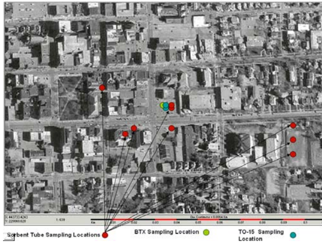
Figure 1. 6-hour sorbent tube sampling locations