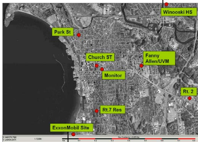
Figure 2. 24-hour TO-15 Canister sampling locations