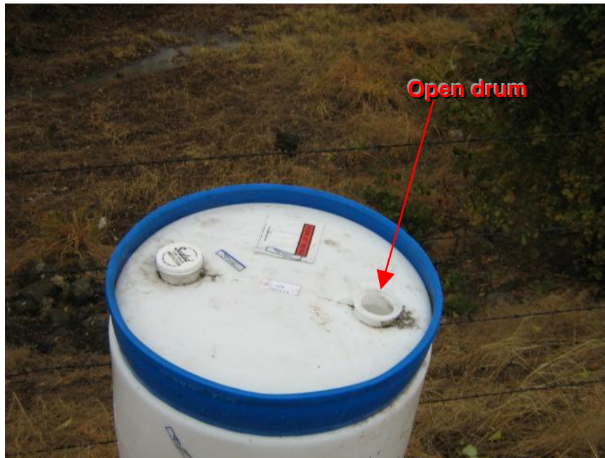
Photograph 3. District 2 Red Bluff Slab Project – Open drum of detergent along the highway storm water conveyance system. (Note: Drum appeared empty, possibly due to the missing bung)