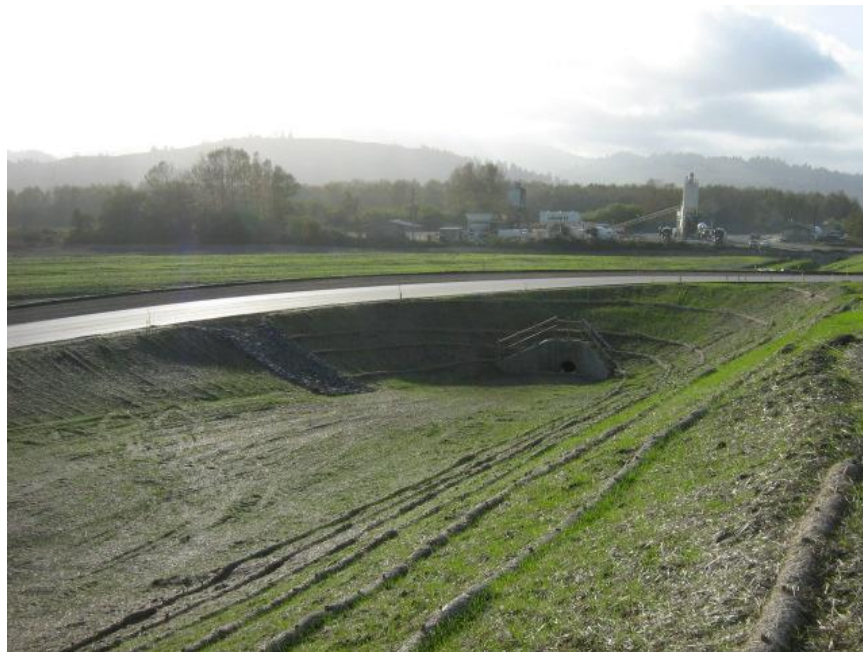
Photograph 2. Alton Interchange Project – Combination of multiple erosion and sediment controls