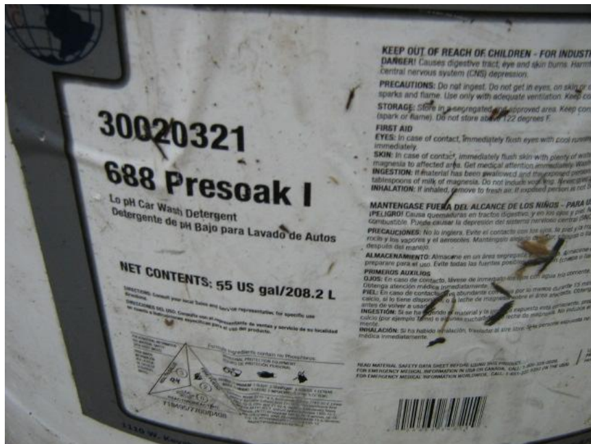
Photograph 4. District 2 Red Bluff Slab Project – Close-up view of drum label corresponding to Photograph 3