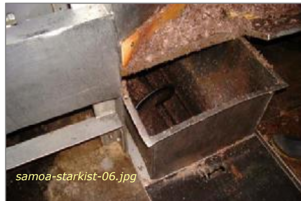
Photo #6: Processing Scrap - Auger to Rendering Date: 04/03/08