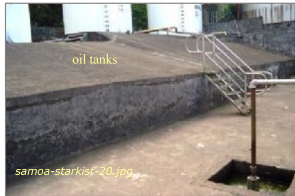
Photo #12: Tank Farm - Showing 2° Containment Date: 04/03/08