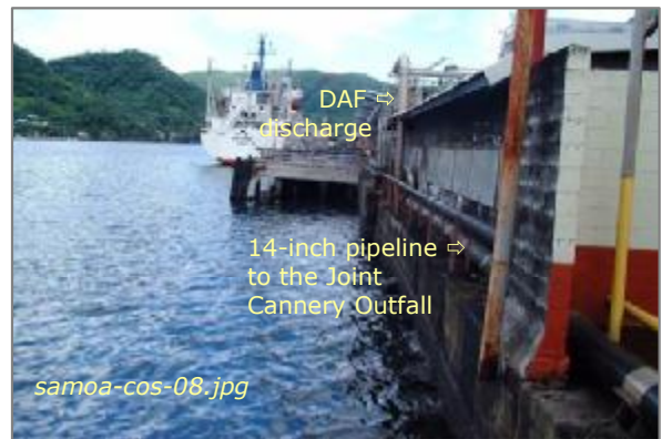
Photo #14: Joint Cannery Outfall Connection Date: 04/02/08