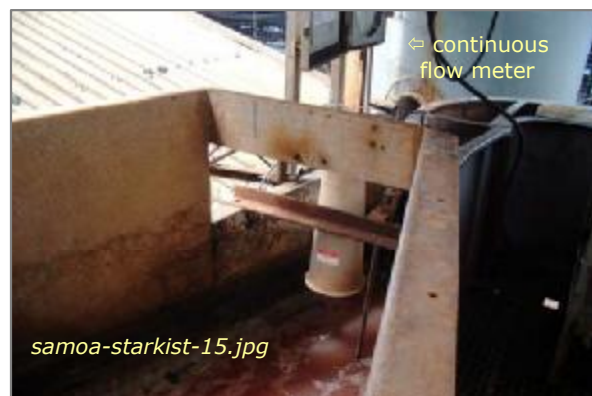
Photo #10: NPDES Sample Point - Flow Meter Date: 04/03/08