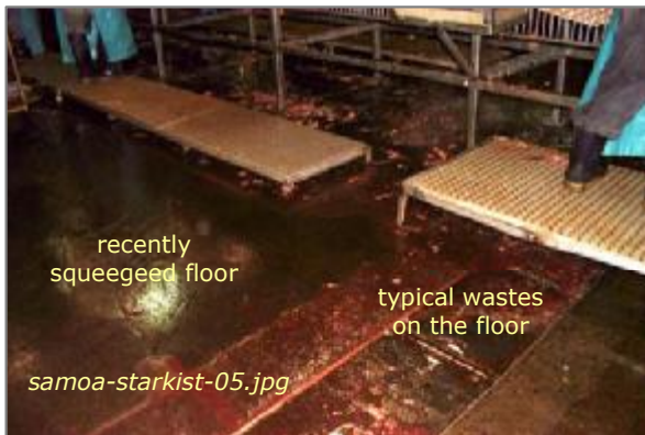
Photo #5: Butchering Room Floor Date: 04/03/08