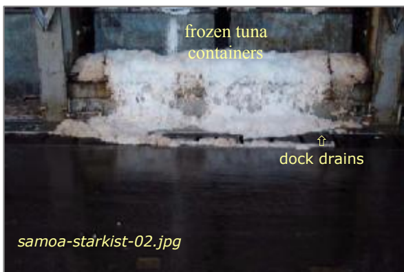
Photo #3: Thawing Bay - Fish Slime Foam Date: 04/03/08