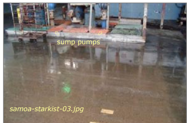
Photo #4: Dockside Wastewater Sump Date: 04/03/08