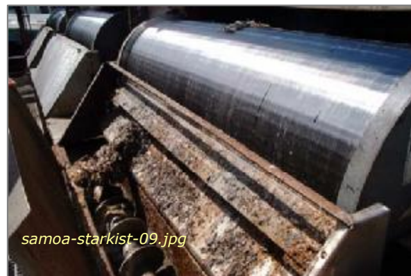
Photo #8: Low-Strength Treatment - Rotoscreens Date: 04/03/08