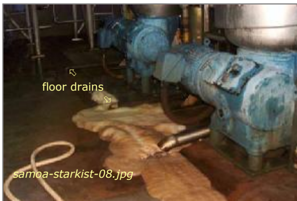
Photo #7: Fish Oil Processing - Decant to Drain Date: 04/03/08