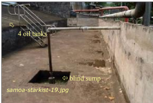
Photo #11: Tank Farm - Showing 2° Containment Date: 04/03/08