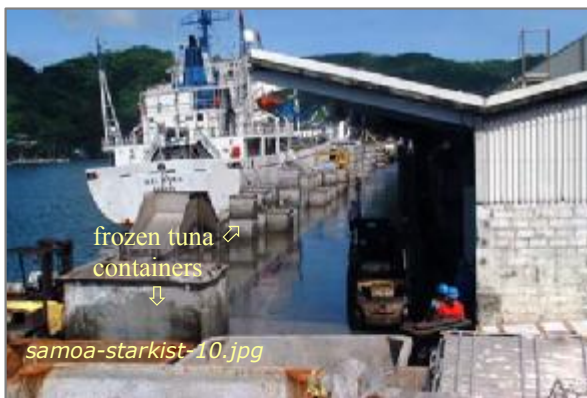
Photo #1: Harbor Dock - Dock Washed and Clean Date: 04/03/08

Thirteen of the 23 digital photographs taken during this inspection and one of the 12 taken from and earlier inspection of COS Samoa are depicted here in this section. The Starkist Samoa photographs are saved as samoa-starkist-01.jpg through -23.jpg . The COS Samoa photograph is saved as samoa-cos-08.jpg .