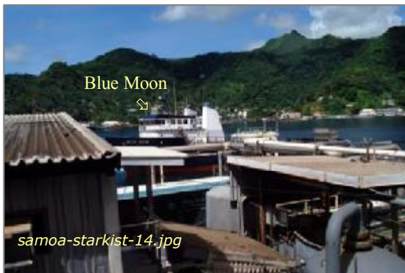
Photo #13: Blue Moon - Ship to Ocean Dump Site Date: 04/03/08