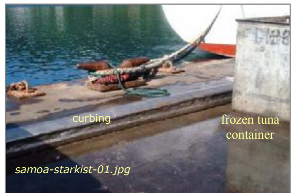
Photo #2: Harbor Dock - Curbing and Cleanliness Date: 04/03/08