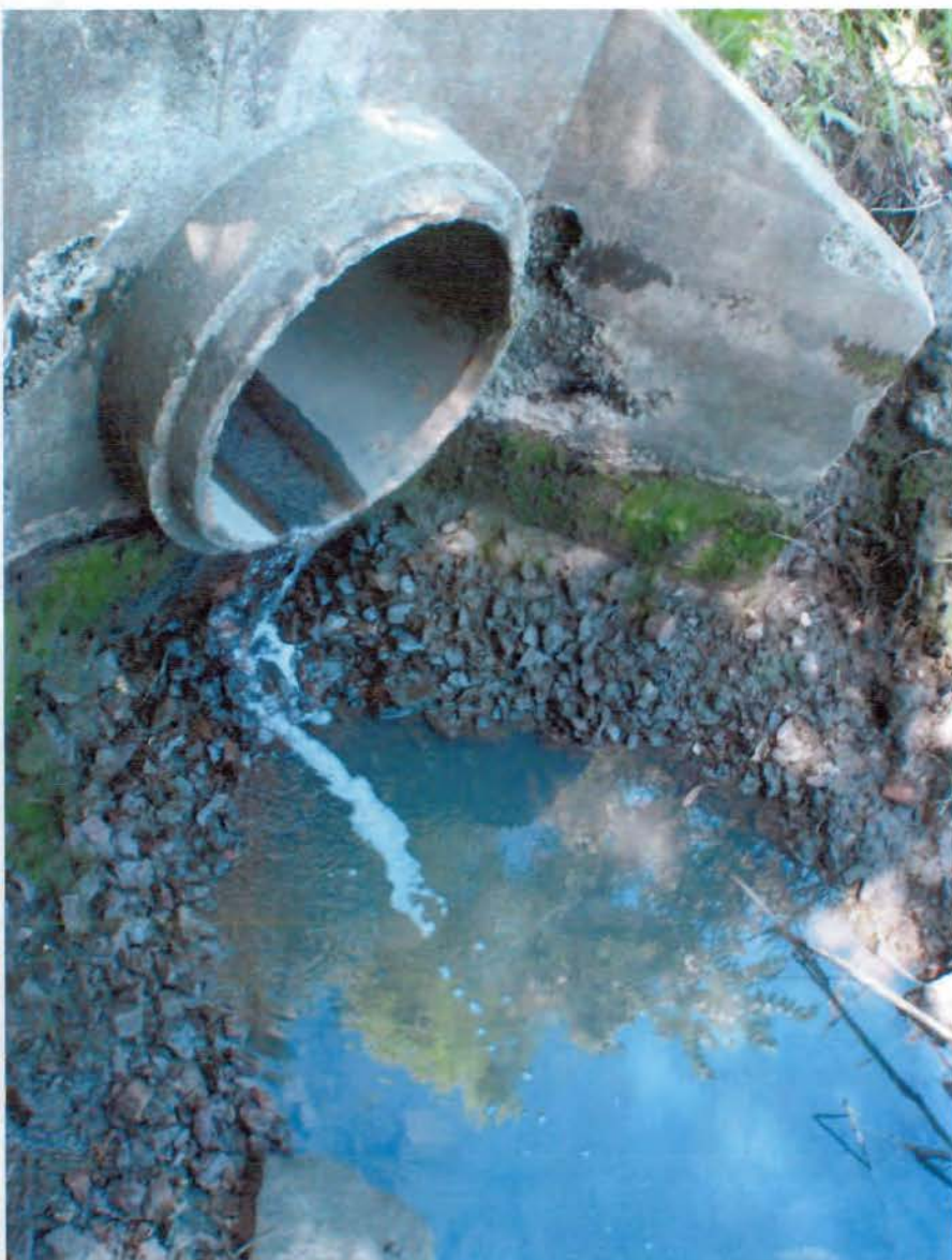
Note off-white filametous bacterial growth