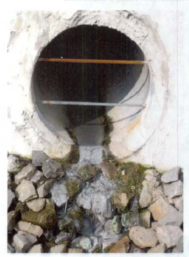
EPA NE Stormwater Outfall Sampling Protocol – Attachment 1 Stormwater Outfalls With Indicators of Illcit Discharges