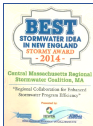
Figure 1: CMRSWC's "STORMY Award" for Collaborative Efforts in Stormwater Management

The Coalition was honored as a recipient of the first Annual "Best Stormwater Idea in New England", also known as a STORMY Award ( see image below ). This honor was bestowed by the New England Stormwater Collaborative, a joint effort of the New England Water Environment Association (NEWEA), the New England Chapter of the American Public Works Association (APWA), and the New England Water Works Association (NEWWA). A representative from the Town of Uxbridge accepted this honor at a ceremony in Worcester, MA on April 1, 2015.