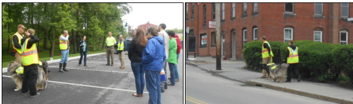
Figure 5: Environmental Canine Services, LLC, Performing a Demonstration of Innovative IDDE Approaches in Millbury, MA

On May 23, 2014, the Town of Millbury hosted a demonstration by Environmental Canine Services ( www.ecsk9s.com ) and invited Coalition members, MassDEP, and other communities to observe. ECS uses two highly-trained dogs (see photos below) to detect the presence of human sewage (both fecal bacteria and metabolic byproducts) very low levels in water at outfalls and catch basins, without interference from non-human sources of bacteria. This interesting approach represents an accurate, quick, and cost-effective screening tool for locating illicit discharges. Water quality samples were collected to evaluate the observations noted by the dogs. Inspections were documented in the Coalition's online mapping and inspection system, with forms that have been updated to allow our communities to use this innovative approach to IDDE.