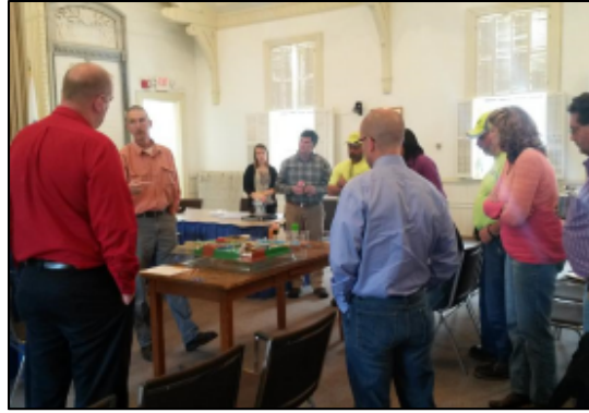
Figure 3: CMRSWC Members Learn How to Demonstrate Stormwater Pollution Prevention Using the Coalition's Nonpoint Source EnviroScape model

With the purchase of this second model, the CMRSWC can make this popular resource more readily available across the substantial geographic spread of our 28 municipal members. The presence of second unit also allows towns to easily demonstrate the impacts of stormwater pollution and ways to prevent it, showing the resulting differences in water quality when Best Management Practices (BMPs) are installed on one unit, but not on the other unit. One model is stored in Charlton, MA, and the other stored in Shrewsbury, MA to facilitate any member town having easy access to the tool.