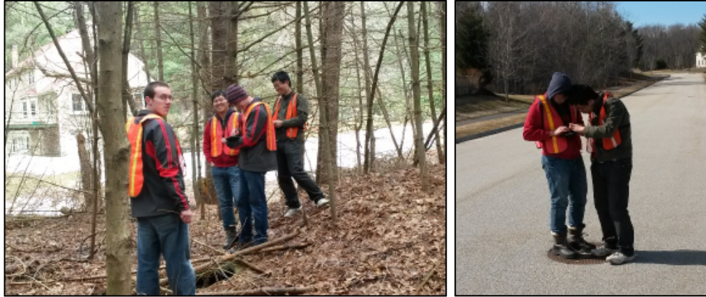
Figure 2: The Coalition's Spring 2014 WPI IQP Student Team Inspecting and Mapping Stormwater Infrastructure in Upton, MA

The Coalition appreciates the ongoing dedication of MassDEP to work with our members so closely and collaboratively.