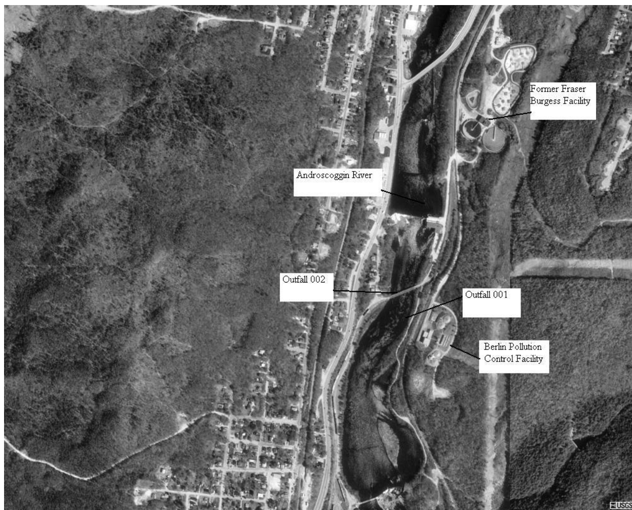
Aerial Photo (May 15, 1999).