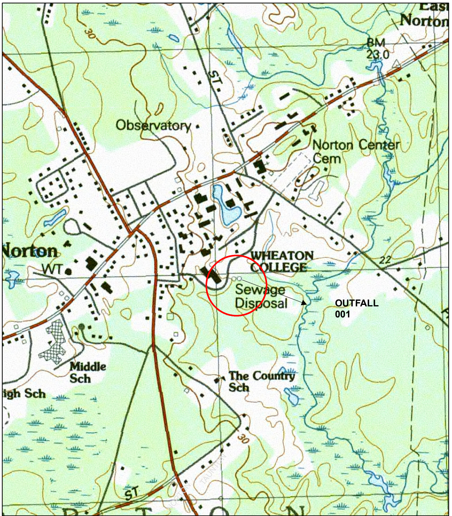
Figure 1. Location Map Wheaton College WWTF NPDES No. MA0026182