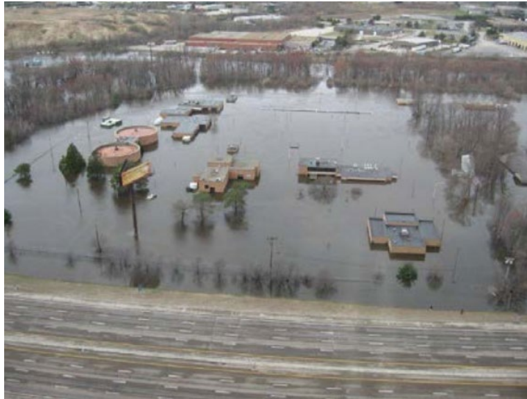
Figure 1: The flooded Warwick wastewater facility on Wednesday, March 31, 2010.

with its permit limits for a period of about 80 days. 11 Due to this flooding, the facility updated their flood protection plans based on local storm and flooding data and implemented improvements for the WWTS, including raising the levee to protect the WWTS from inundation caused by a 500-year flood event. 12