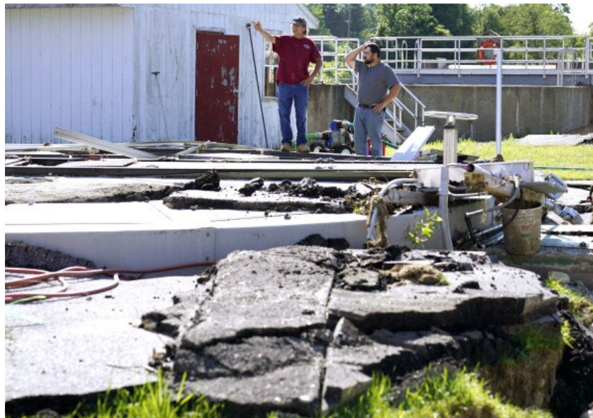
Figure 2: Ludlow Wastewater Treatment Plant (photo August 2, 2023, taken after July storm event) 16

[t]he facility that keeps the village’s drinking water safe was built at elevation and survived. But its sewage plant fared less well. Flooding tore through it, uprooting chunks of road, damaging buildings and sweeping sewage from treatment tanks into the river. Even [over three weeks after the storm event] the plant can only handle half its normal load. 15