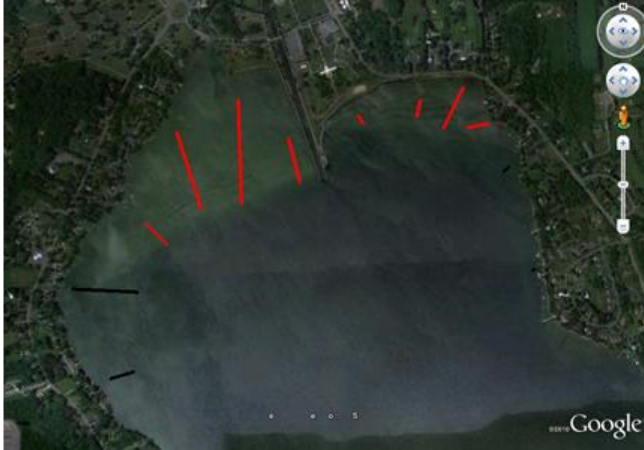
Asian clam transect data. Red indicates presence of clams.

Bottom sediments in the northern end of Owasco Lake are mainly sand and silty sand in the shallow areas of the lake. As the bottom becomes deeper sediments become finer, softer and populated with rooted plants and algae. No clams were found in the softer plant choked sediments. We did not do a formal aquatic plant survey but Owasco Lake seems to have typical communities for lakes of this latitude. The green alga Chara forms dense patches in many areas of the lake that we surveyed. The area just south of Burtis Point did have a narrow band of sand and gravel near shore but no Asian clams were collected there.