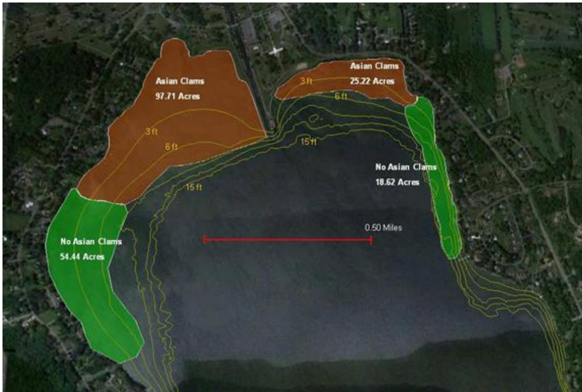
Northern Owasco Lake estimated Asian clam distribution. Depth contours are in 3 foot increments.

in the laboratory did not support this. No living clams were found along the domestic water intake pipe nor in the vicinity of the intake crib.