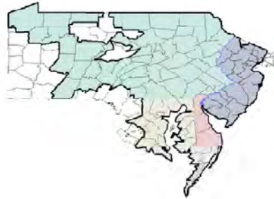
Mid-Atlantic Area Council (MAAC) Regional Power Pool