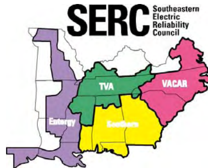
Southeastern Electric Reliability Council (SERC) Regional Power Pool