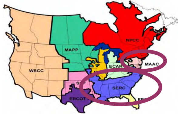
Figure 1 – Power Pools