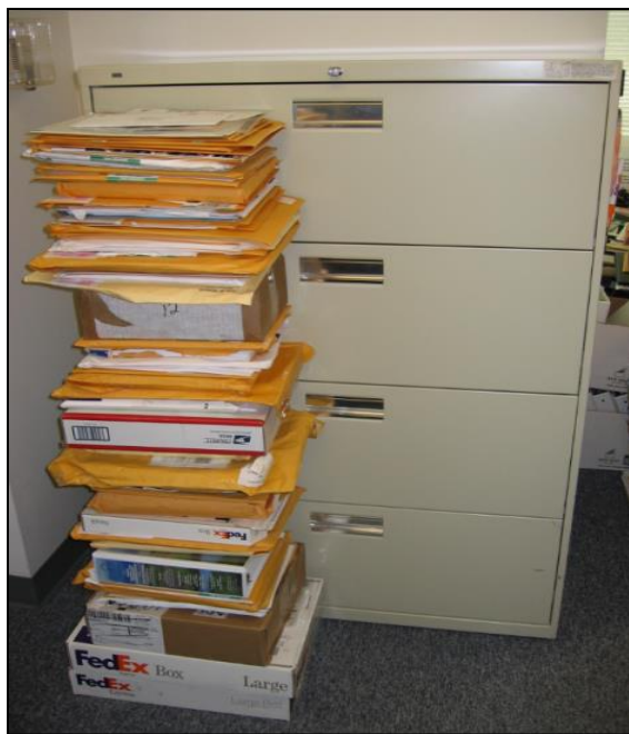
EPA Region 9 Annual Pretreatment Reports