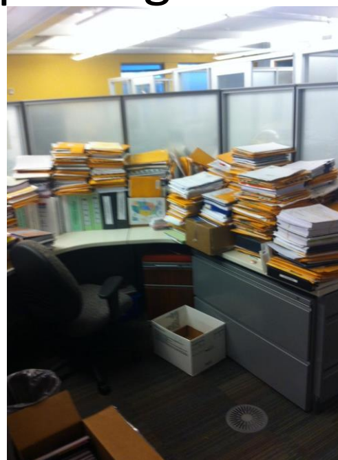
EPA Region 7 Annual Biosolids Reports