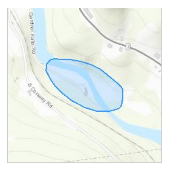
Counties: Franklin County, Massachusetts

The approximate location of the project can be viewed in Google Maps: <u>https://www.google.com/maps/@42.5897571,-72.72664406075442,14z</u>