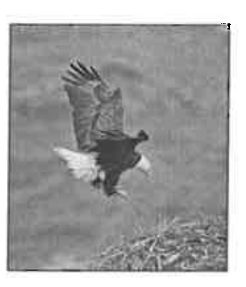
NCTC Eagle Cam

This Bald Eagle image is a link to a Service website that chronicles the activities of the eagle nest located on the grounds of the USFWS National Conservation Training Center near the Potomac River in Shepherdstown, West Virginia. The nest has been active for four seasons, fledging several juvenile bald eagles.