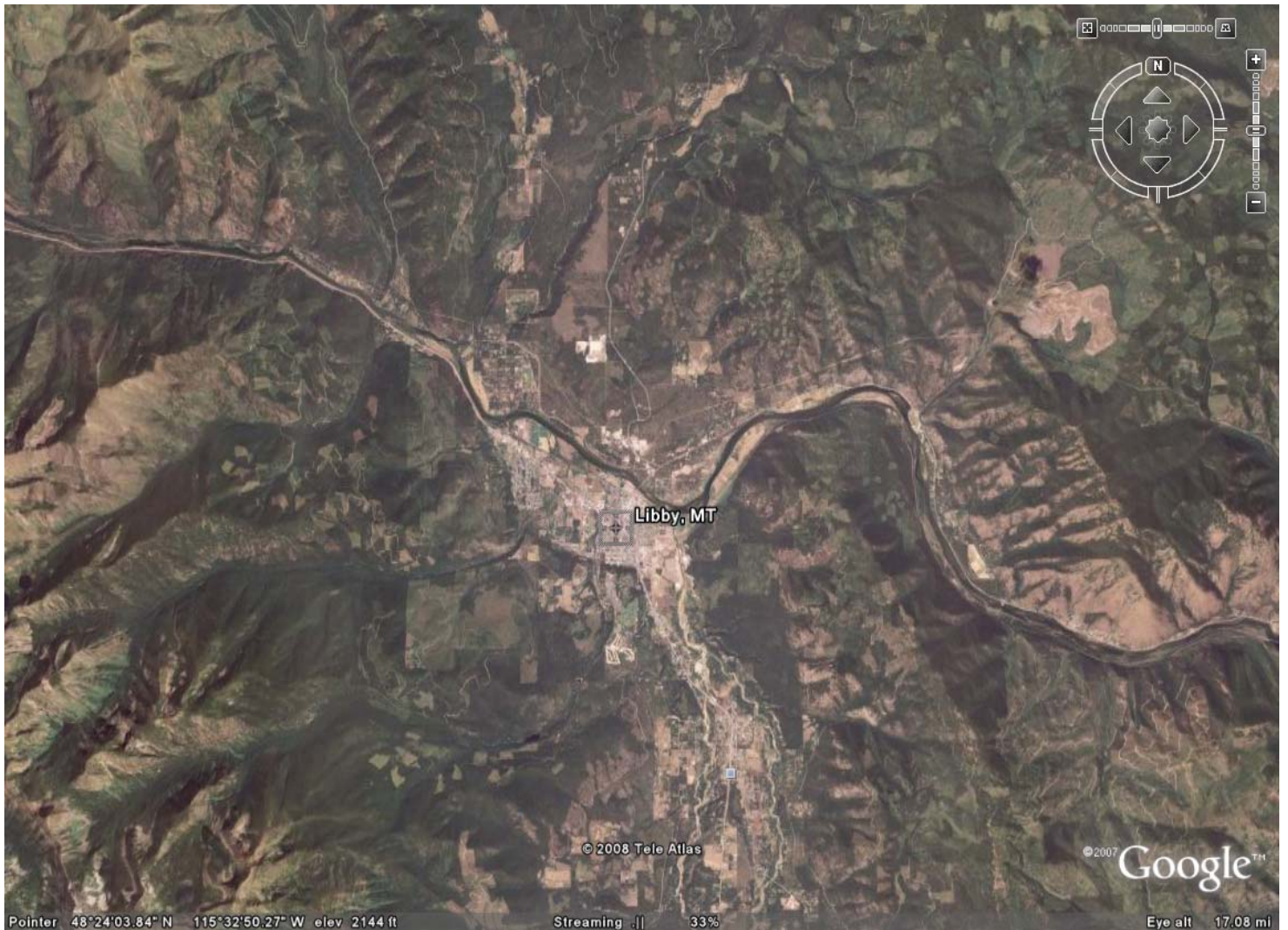
Figure 3: Libby, MT area from Google Earth™