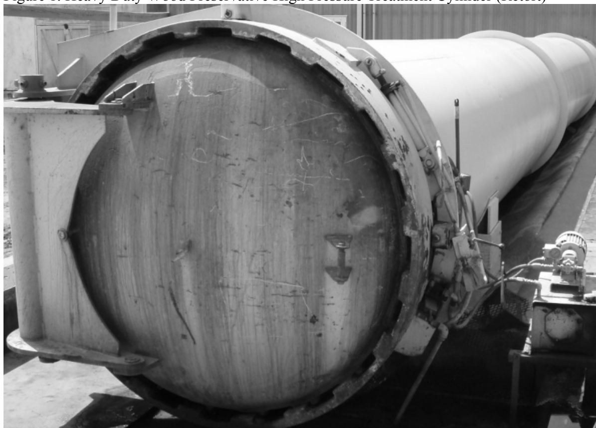
Figure 1. Heavy Duty Wood Preservative High Pressure Treatment Cylinder (Retort)

Again, due to the unique nature in which heavy duty wood preservatives are applied, wood preservative risk assessment requires a different approach than those used for standard agricultural or antimicrobial pesticides. For example, unlike agricultural pesticide handlers who may be exposed to pesticides when mixing/loading, applying, or re-entering an area treated with