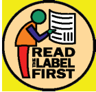
[Front cover of booklet on the back label]