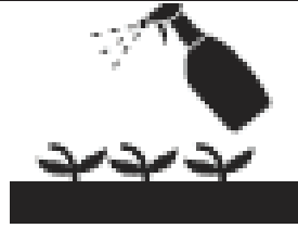
[Under "How to use" section]