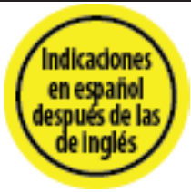
[Font cover of the booklet on back label]