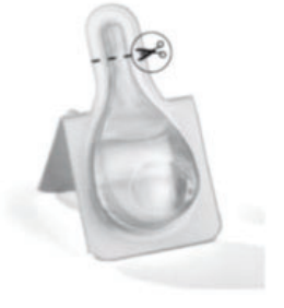
{OPTION 1, If package contains individual applicators}