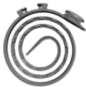
Proprietary Triple Clasp System