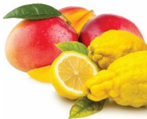
Mango Citron (Jagger Collection)

(List of optional scent images for Better Homes & Garden collection names:)