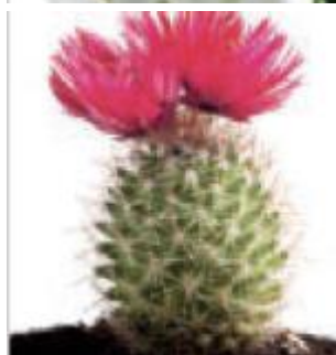
Desert Blooms (Ridge Collection)