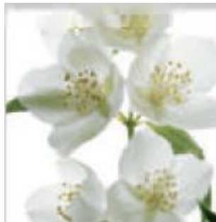
Silk Jasmine. (Maya Collection)