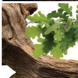
French Oak (Debbie Collection)