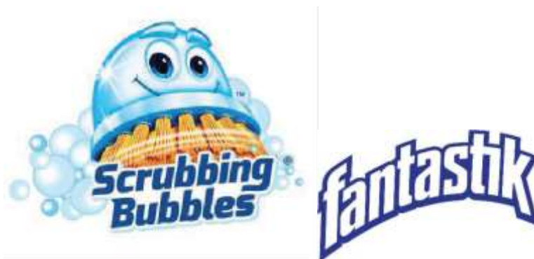
Representative Location Graphics