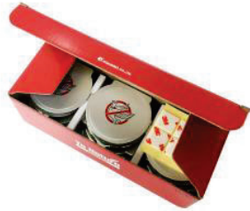
Bird Free DIY