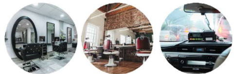
Salons and Barber Shops