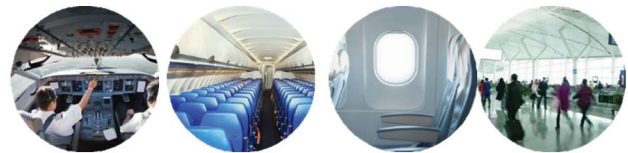
Airports and Airplanes