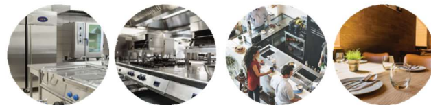
Professional Kitchens and Restaurants