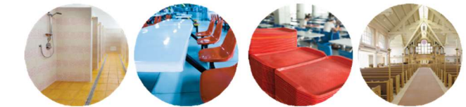
Shower & Bath