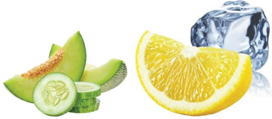
[Sweet Honeydew & Cucumber]

{Optional Graphic – following graphic may or may not appear on label}