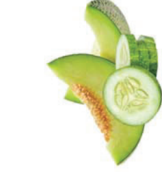
[Sweet Honeydew & Cucumber]