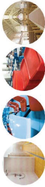
Shower & Bath