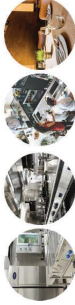
Professional Kitchens and Restaurants