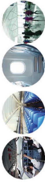
Airports and Airplanes