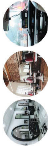
Salons and Barber Shops