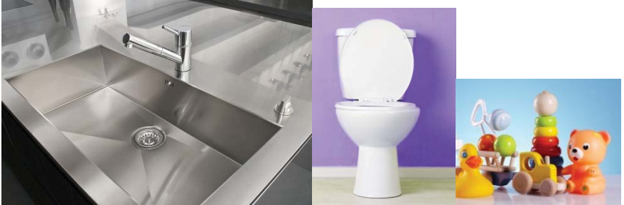
{Optional Graphic – following graphic may or may not appear on label}