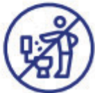
Do not flush