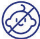
Do not use as a baby wipe