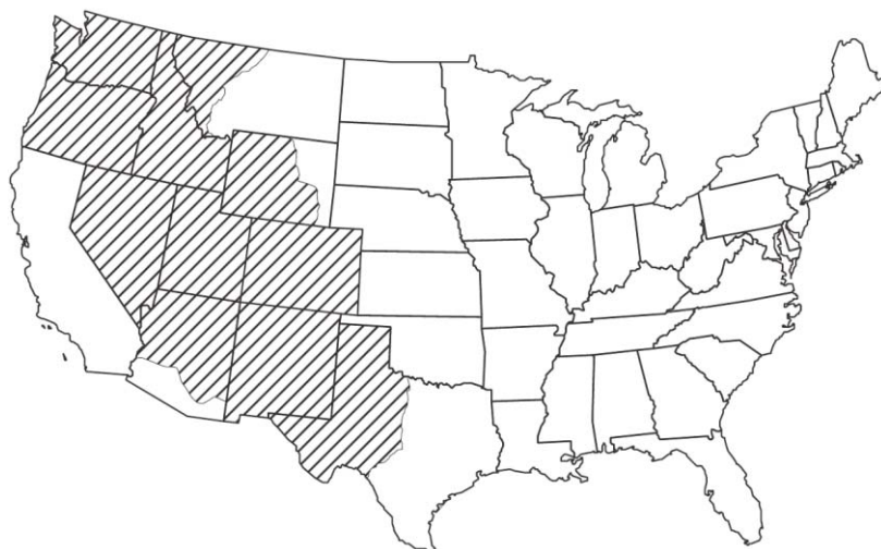
14-Day PHI Area for Barley (shaded areas)