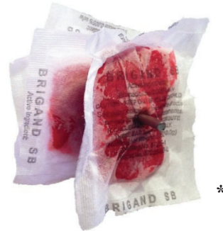
*not representative of a bait placement