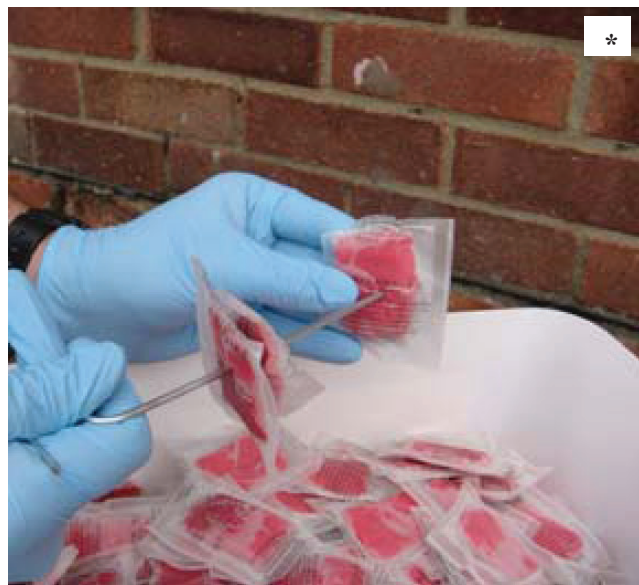
*Picture depicts threading of bait for placement inside a bait station