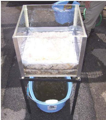
Picture 2. Hydrotest Device