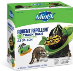
Laboratory Studies Show the effectiveness of the Mint-X Trash Bags at Reducing Rat Torn Bags.