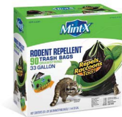
Laboratory Studies Show the effectiveness of the Mint-X Trash Bags at Reducing Rat Torn Bags.