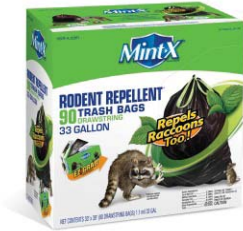
Laboratory Studies Show the effectiveness of the Mint-X Trash Bags at Reducing Rat Torn Bags.