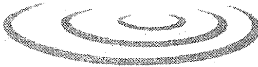
Water/Whirlpool rings used as background on labels, advertising and other media. Sizes vary by use and/or placement.