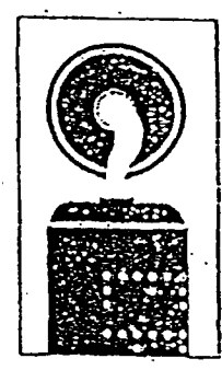
[This graphic shows use of the towel dispenser.]