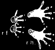
House Mouse ( Mus musculus )