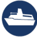
[Boat 1 Icon]