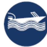
[Boat 2 Icon]