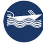
[Boat 2 Icon]