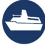
[Boat 1 Icon]