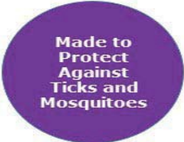
Alternate to "Made to Guard".