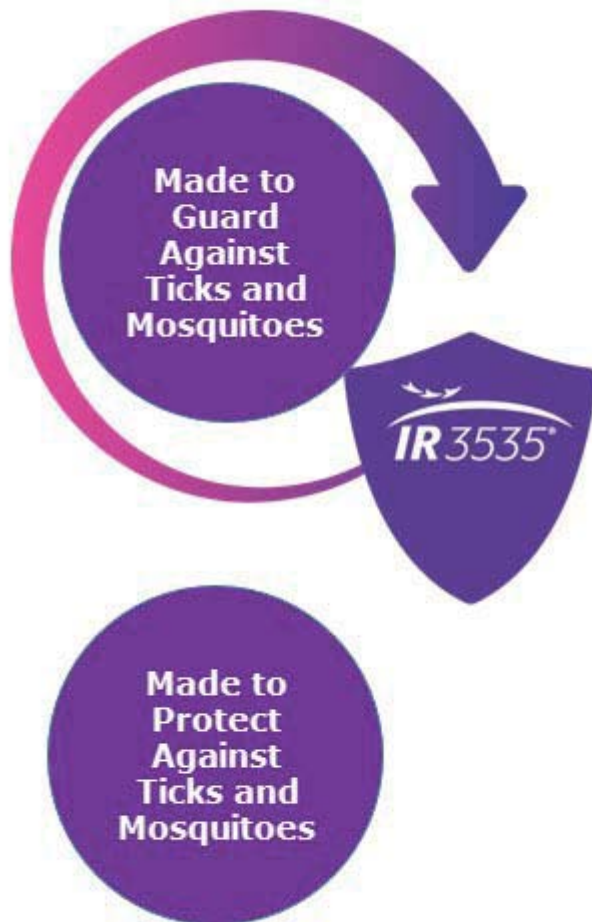
Alternate to "Made to Guard".