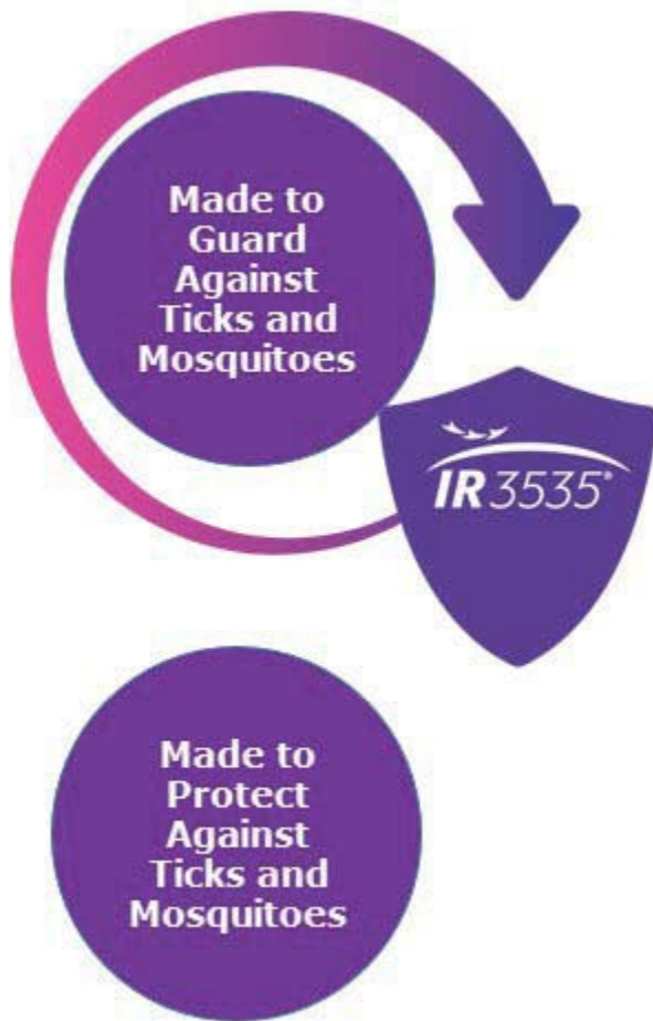
Alternate to "Made to Guard".