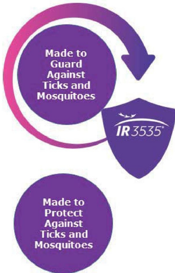
Alternate to "Made to Guard".