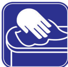
For hard, non-porous surfaces