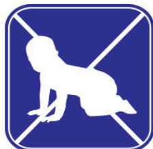
Not a baby wipe Not for personal use