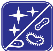
One-step cleaning and disinfection