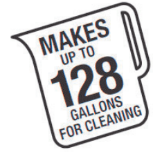
{Used on 128 fl oz bottle}