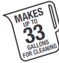
{Used on 33.8 fl oz bottle}