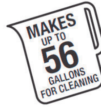
{Used on 56 fl oz bottle}