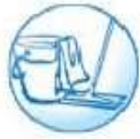
[Mop and Bucket]