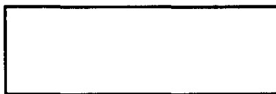
Injection Into the Cambial Tissue of the Tree