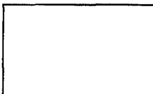
Cross-section of tree showing Wedge™ Tip and WedgeChek™