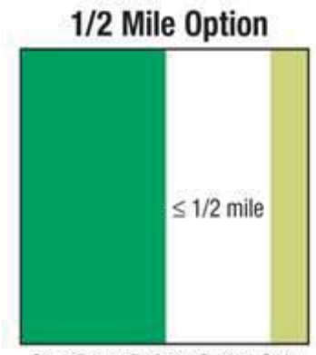
Corn Borer Refuge Option Only

The following is a schematic of a separate refuge deployment option: