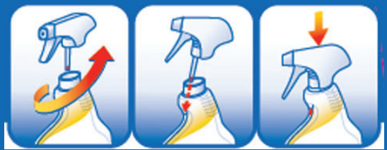
Twist off, Refill Align Tip to Tube Push, Snap to Close

Twist trigger on spray bottle counterclockwise and pull upward to remove. Refill spray bottle. To replace trigger, align red tipped tube on trigger over tube opening inside of the bottle. Press straight down on the trigger until it clicks into place.