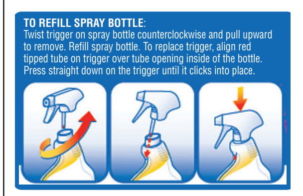
Align Tip to Tube Push, Snap to Close Twist off. Refill