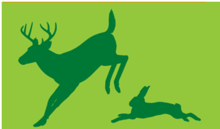
{Optional Graphic of Deer & Rabbit}