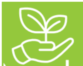
{Safer Brand Garden Logo}