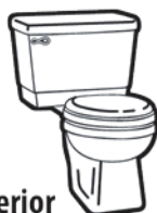
Exterior Toilet Bowl Surfaces