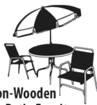
Non-Wooden Outdoor Patio Furniture Except Cushions & Wood Frames